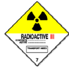
RADIOACTIVE YELLOW III