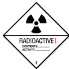
RADIOACTIVE WHITE I